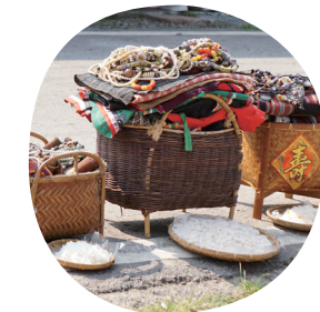
Ancestral spirit basket

The Thao tribe mainly inhabits the Ita Thao Community in Yuchi Township and Dapinglin Community in Shuili Township. Currently, its population is less than 1,000. Even today, the residents of the Ita Thao Community practice ancestral worship that includes the ulalalan (ancestral spirit basket). Sowing rites and hunting rites are held in the third and seventh months on the lunar calendar, respectively. The Ancestral Spirit Ceremony, which takes place in the eighth month, is the most important of the Thao ceremonies.